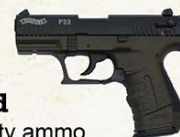
Walther P22 .22LR Pistol Unsuppressed Firing CCI standard velocity ammo