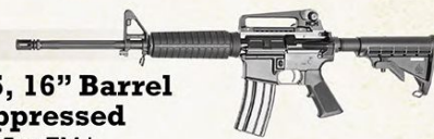
AR-15, 16" Barrel Unsuppressed Firing 55gr FMJ