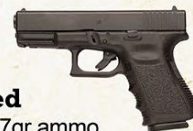
Glock G17 9mm Pistol Unsuppressed Firing Remington UMC 147gr ammo